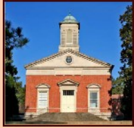
Northside Drive Baptist Church