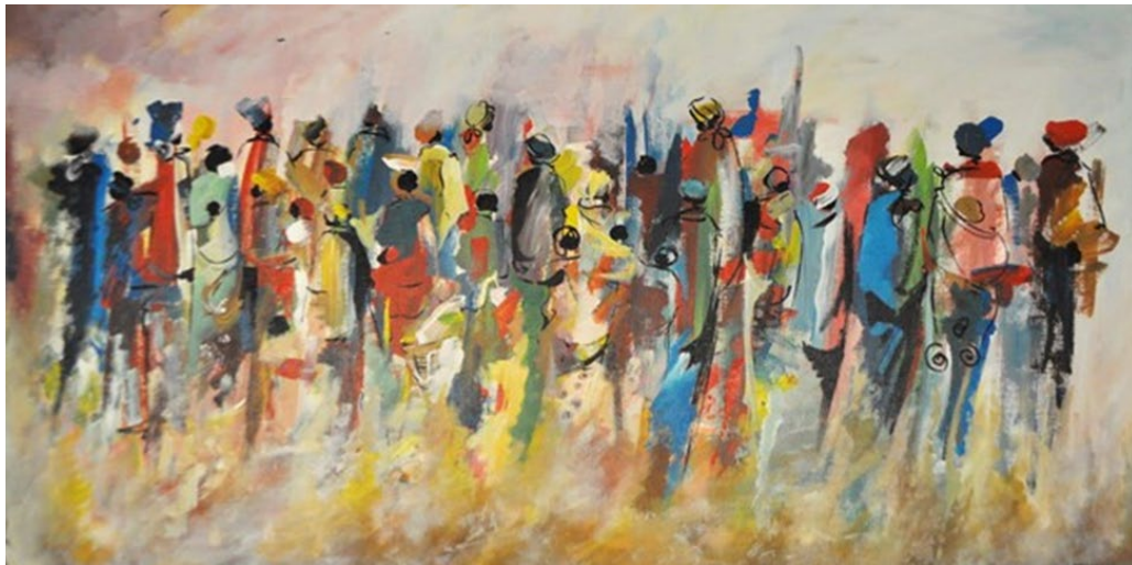
Sending Out the 70, artist unknown