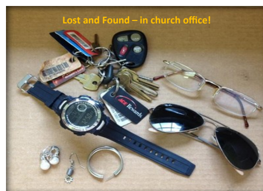
Lost and Found – in church office!