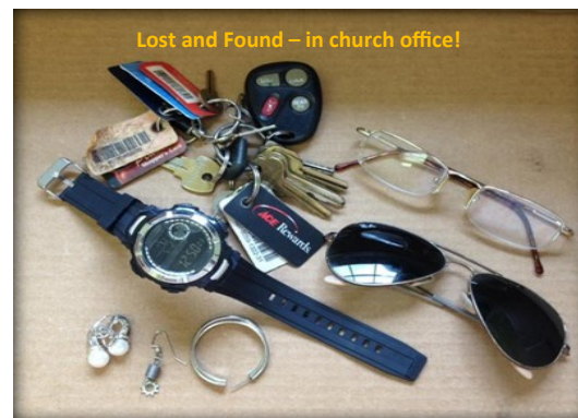
Lost and Found – in church office!