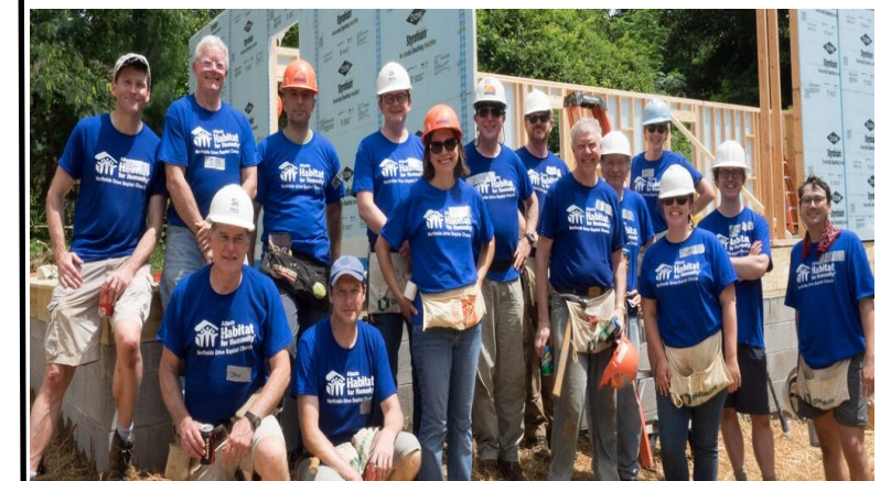
NDBC Habitat crew 2018